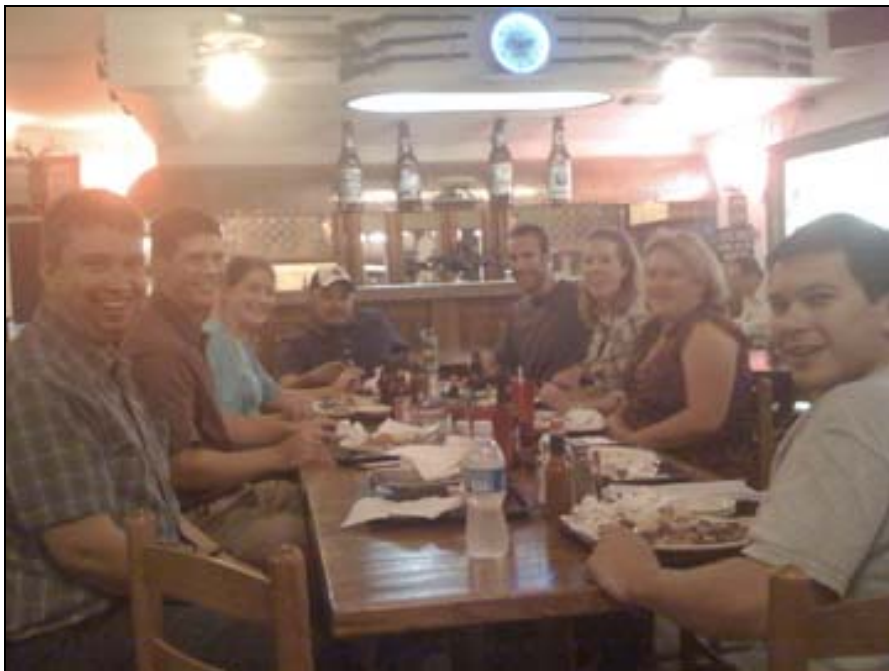
AAPG-SEG EXPO SDSU participants at dinner (Houston, TX) – After a long day of interviews, meetings and networking at the AAPG-SEG Expo in Houston (TX), fellow participants from the current AAPG-SDSU organization and past AAPG-SDSU organization get together for dinner.