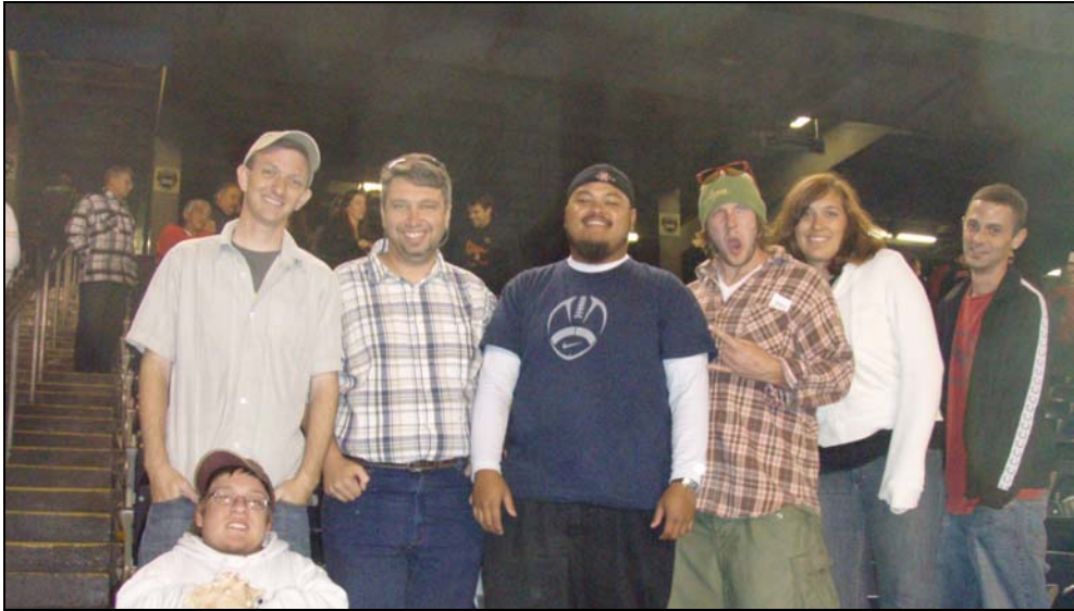
AAPG-SDSU Aztecs vs. Rebels tailgate at Qualcomm Stadium (San Diego, CA) – Everyone's smiling after a great game where the Aztecs won on Senior night to close out the college football season.