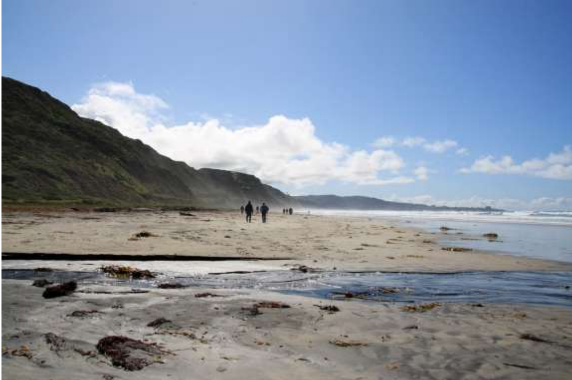
First Bi-annual SDSU-AAPG Beach Cleanup, Mission Beach