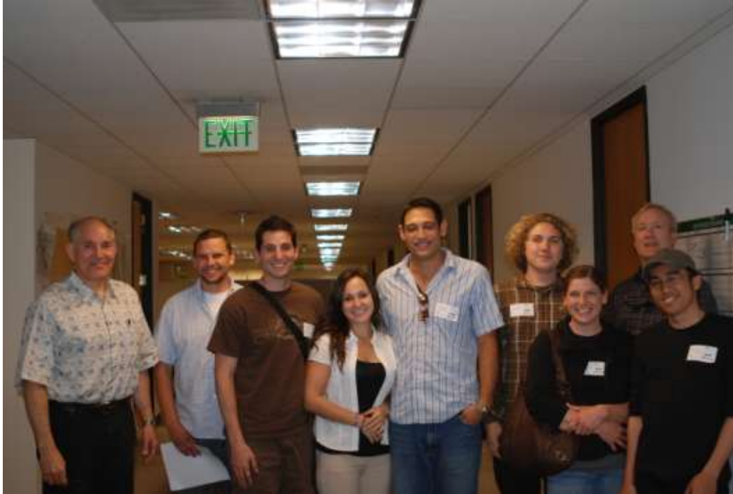
Imperial Barrel Award Pacific Section 2010